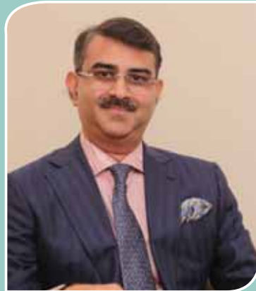
>L ljsf; bu8 ; ~rfns