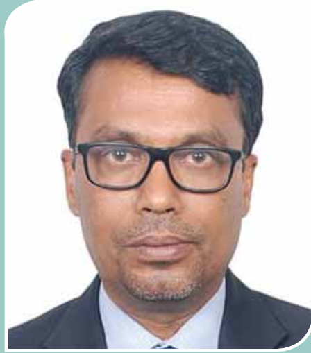
>L kzktl d'f/sf cWOLF